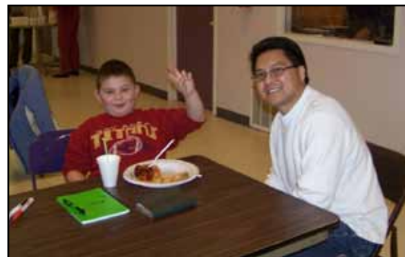
Teens and children from Freedom for Youth are involved in work, study and fellowship.

Beginning this fall, Gloria Dei will begin its third year of serving dinners to the youngest children and their tutors the first Monday of each month. Dinners are served at 5:30 p.m.